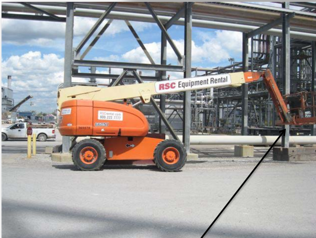
Location of the cracks