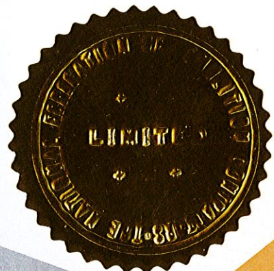
NFDC Chief Executive Officer

A handwritten signature in black ink, consisting of a large, fluid loop followed by a horizontal line and a short vertical stroke.